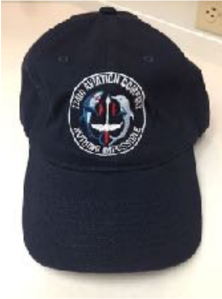
Unit Patch Soft