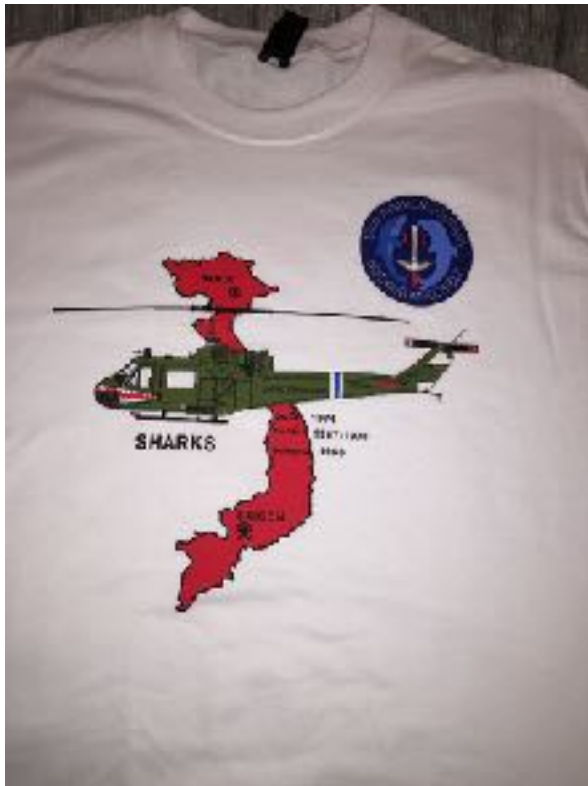
Huey and Map T-Shirt (front)