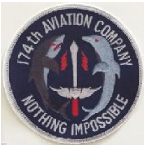
Unit Patch 4" diameter