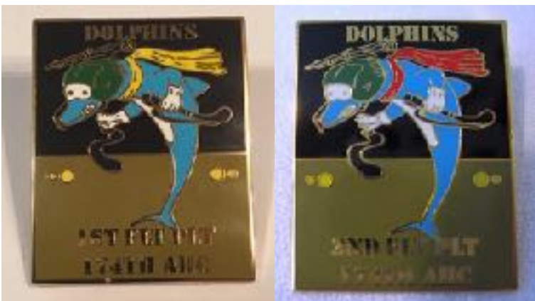
1st Platoon Pin