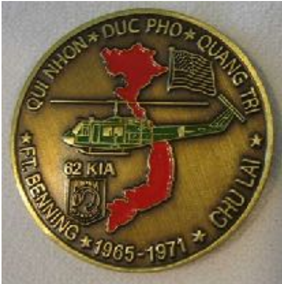
174th AHC Association Challenge Coin, 1-1/2" diameter $10.00