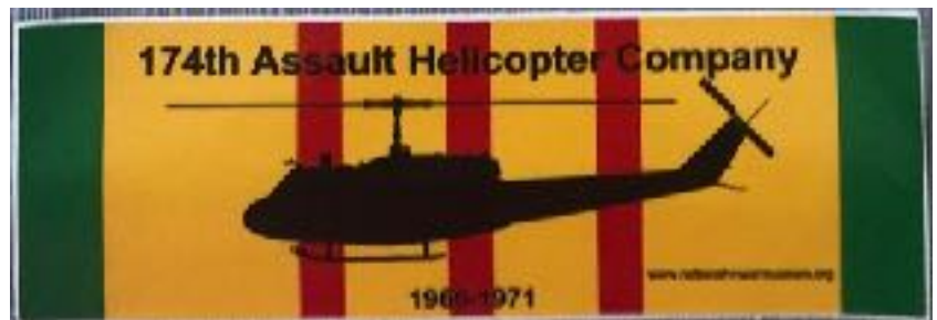
Vietnam Campaign Ribbon, UH-1H