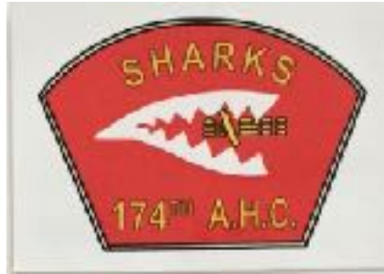
Shark Patch 3"