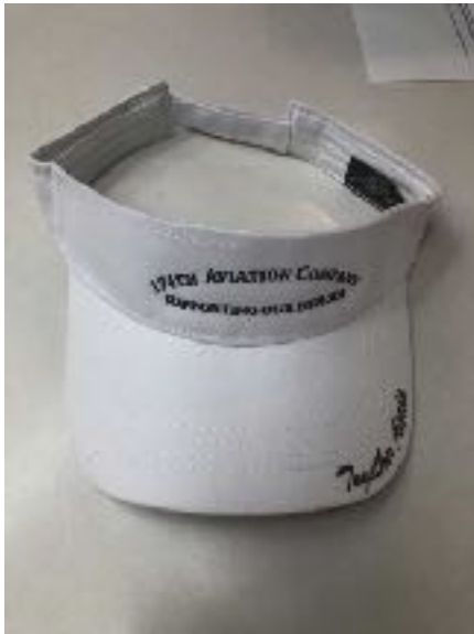
Lady's Visor Front