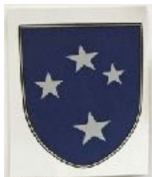
Americal Div. 2.5"

All Stickers $3.00 each Adhesive back stick to exterior window surface or other smooth surfaces.