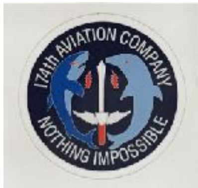
Unit Patch 3" diameter