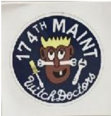
Witchdoctor Patch 3" dia.