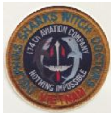
Association Patch 3"