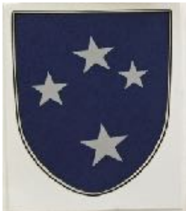
Americal Div. 3"