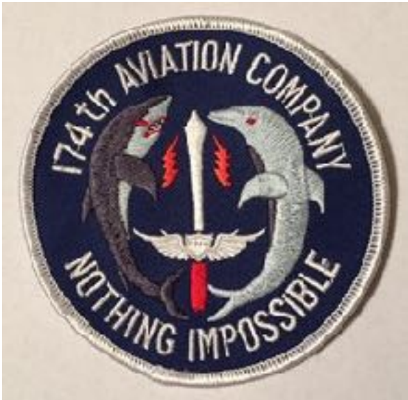
174 th AHC Unit Patch