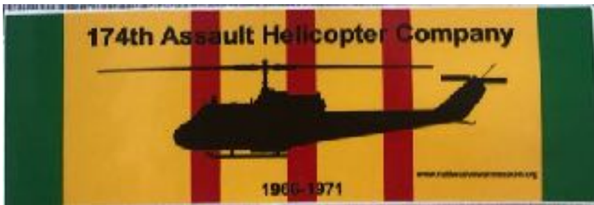
Vietnam Campaign Ribbon, UH-1C