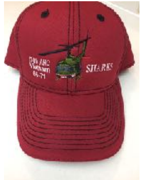
Shark Cardinal Helicopter Stiffened front

All are brushed cotton baseball cap with embroidered design. Velcro adjustment strap.