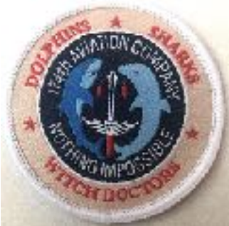
2 Inch Unit Patch

Embroidered Patches, round, approx. 4" diameter, can be sewn directly onto a garment. $6.00 each or 4 for $20.00 (any combination)