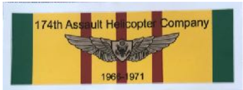
Vietnam Campaign Ribbon Crew Chief Wings