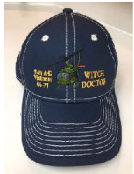
Witchdoctor Navy Helicopter Stiffened front