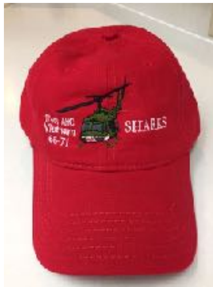
Shark Red Helicopter Soft