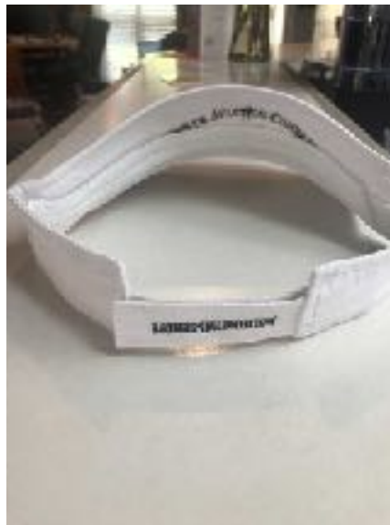
Lady's Visor Back