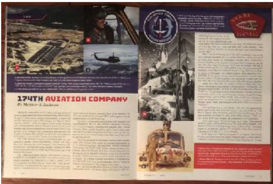
Pages 1 and 2 of Article