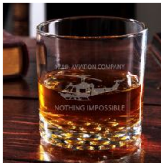
Set of four engraved Cocktail Glasses

Two glasses engraved with the 174 th Unit Patch. Two are engraved with the Unit Name, The unit motto "Nothing Impossible" and a Huey.