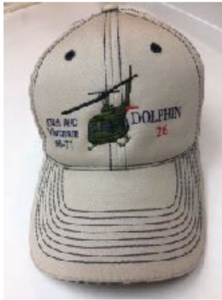
Dolphin Tan Helicopter Stiffened front