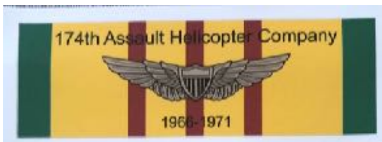
Vietnam Campaign Ribbon, Pilot Wings

All Stickers $3.00 each Adhesive back stick to exterior window surface or other smooth surfaces.