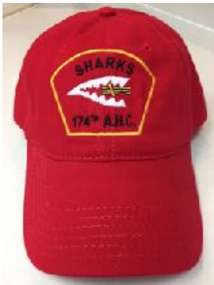
Shark Patch Soft