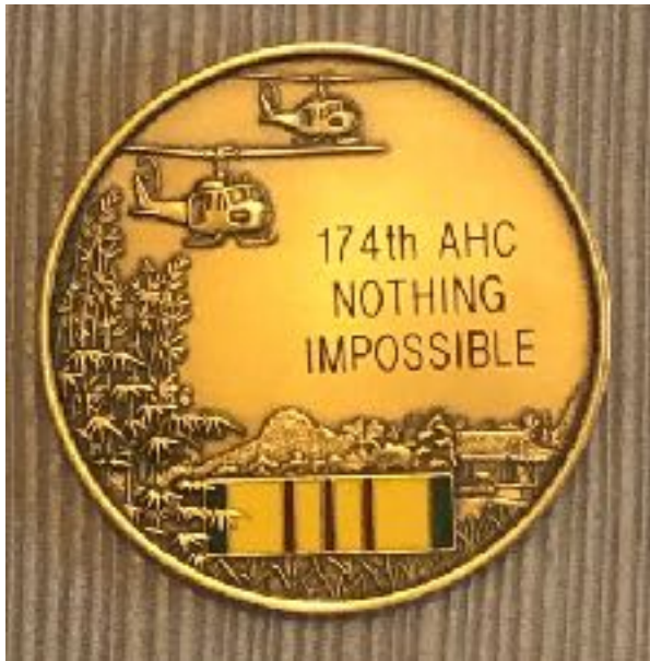
Vietnam 50 th Anniversary Coin 1 3/4" diameter $5.00