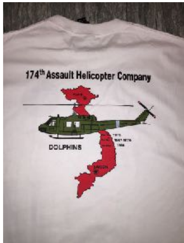
Huey and Map T-Shirt (back)

Huey and Map T-shirt White shirt with Shark and Unit Patch on front and Dolphin and unit name on back Sizes: S, M, L, XL, 2XL, 3XL, 4XL. No pocket. $18